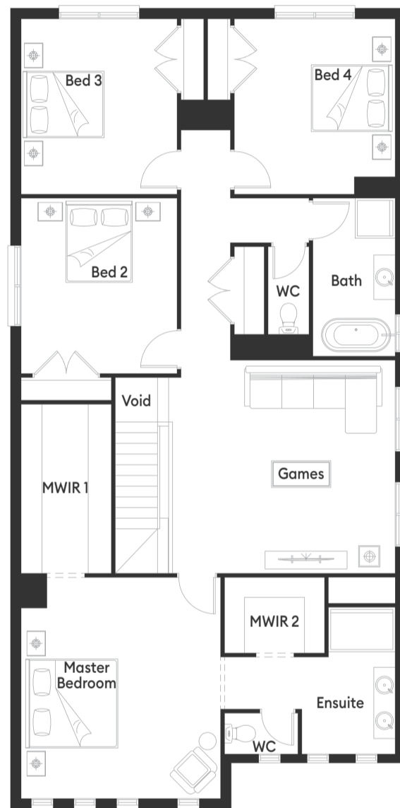
Standard floorplan with Balmain façade